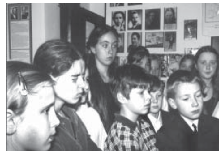
Children visiting our Museum

To reveal the truth about Jewish history and the Holocaust to Lithuanian society and to educate the young generation are important goals of the Museum. Therefore an educational project has been launched. It aims to teach schoolchildren about a part of Lithuanian history, which is hardly dealt with in Lithuanian schools. The project further wants to help children to understand history and to realize its influence on their own life. Schoolchildren and their teachers are invited to the museum where the museum's guides try to rise their interest in these topics.