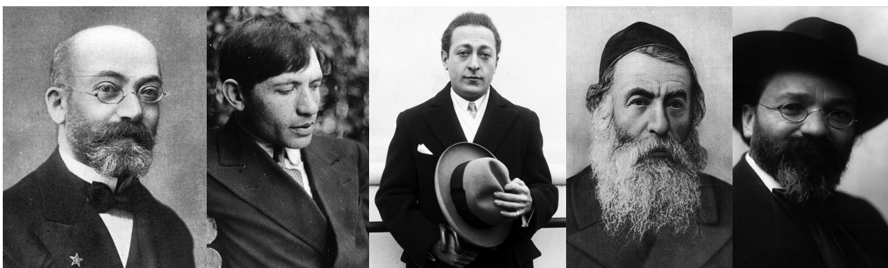
Liudvikas Lazaris Zamenhofas

On 27 September, photography exhibition 'Litvaks on the Streets of Israel' was opened at the Museum's Tolerance Centre. The exhibition invited its visitors to walk down a symbolic Israeli street serving as a connection between a number of streets in Israel named after famous Litvaks: spiritual and cultural leaders of the Jewish community, visionaries of the national State of Israel, including world-famous scientists and artists. ■