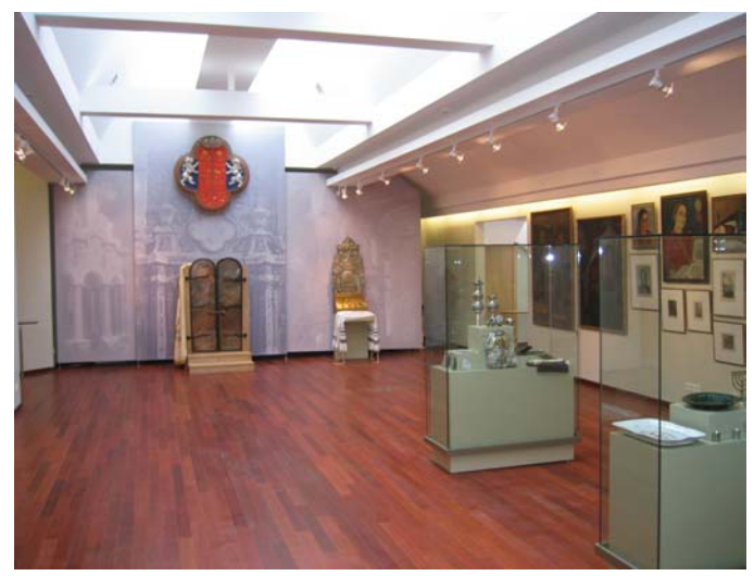
The new exhibition hall of the Tolerance Center