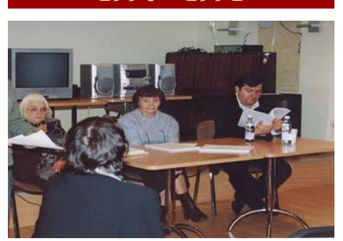
At the museum's book presentation, the Jewish Community, September 2004.

The set of bibliographical directory books was prolonged this year. Following the first index covering the period of 1985 - 1989, this second index, covering the years 1990and 1991 has appeared. In this index the reference to every article concerning Jewish issues (grouped by content), which has appeared during this period in the Lithuanian press, can be found, which makes it an especially valuable tool for research. Each reference consists of a short and precise summary of the articles' content